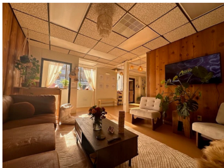
Photograph: The Dock Youth Space