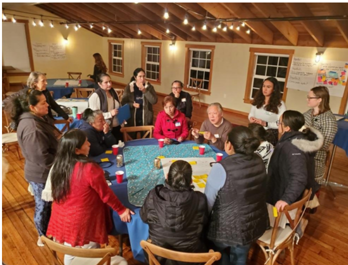
Photograph: Latinx Outreach Program at The Harbor

We have two sponsorship levels for DVAM. For a $500 sponsorship , your business name will be acknowledged on all print and digital marketing, including our t-shirts. For a $1,000 sponsorship , we will include your logo on all associated print, digital, and marketing materials, including our t-shirts. Or join other participating businesses who are donating proceeds from the month of October to The Harbor.